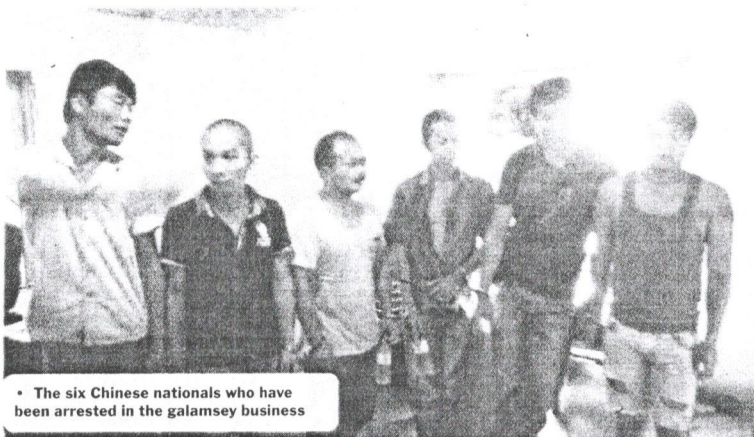
• The six Chinese nationals who have been arrested in the galamsey business

"Through the mining, they are able to take care of their families, pay school fees and meet other social needs; therefore when we speak to them, they ask us what they should do to get the next meal for their dependents," he said.