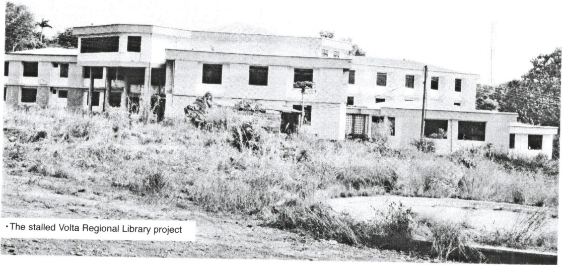
• The stalled Volta Regional Library project

Apart from that, he said the interim library was located beside a