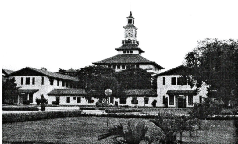
• University of Ghana's Great Hall where academic titles are conferred on deserving students