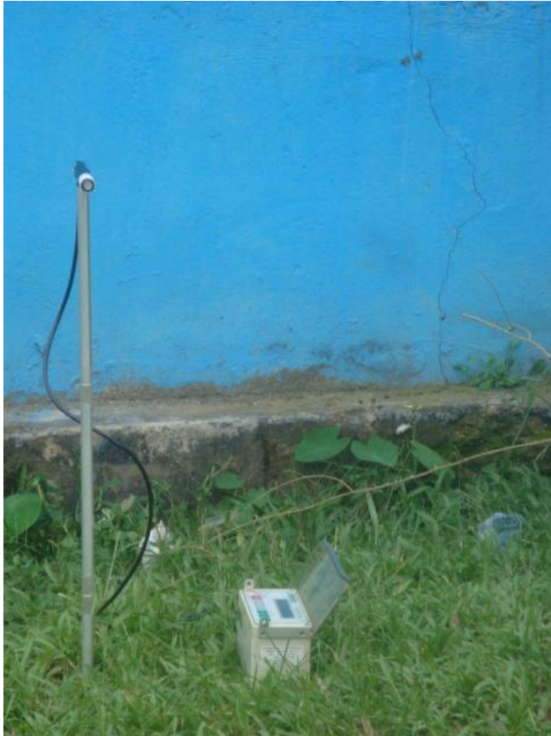
Fig 2 Set-up for Monitoring of Crack, PPV and Airblast