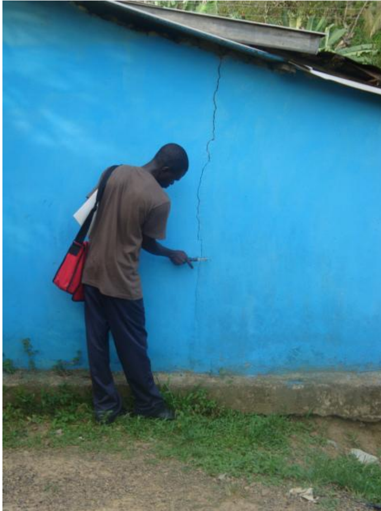
Fig 1 Crack on a Wattle and Daub Building

Crack Description: Near vertical crack extending from the peak of the gable to the foundation of the structure (Fig 1)