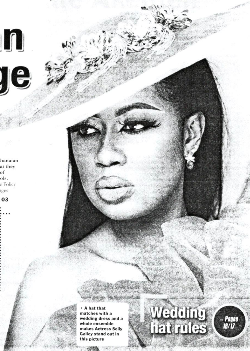
• A hat that matches with a wedding dress and a whole ensemble makes Actress Selly Galley stand out in this picture