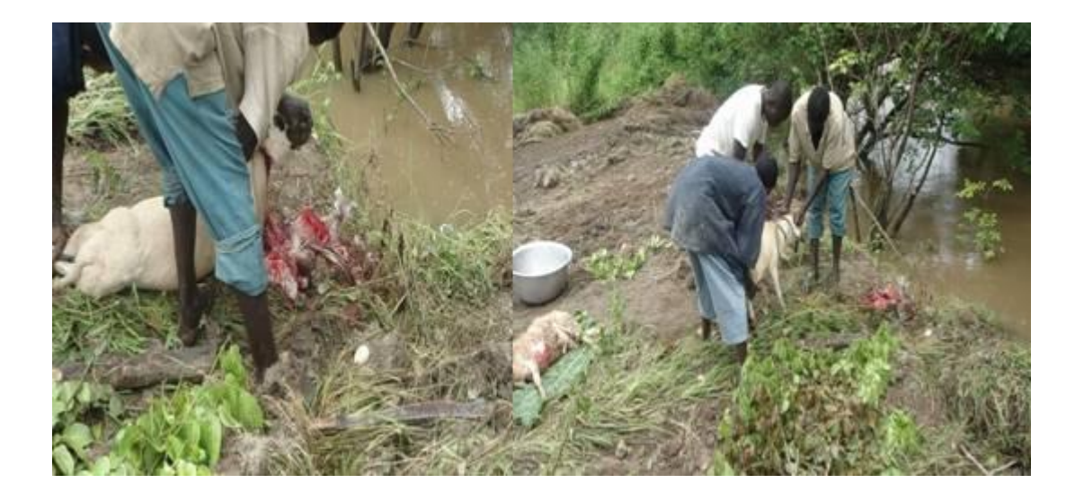
Fig. 2 Small scale miners slaughtering sheep to appease a river god near Dunkwa

someone some amount of pampering is required, so also the miners try to appease the gods or the spirits so that they can give them the gold. Fig. 2 shows sheep being slaughtered at the mining site to appease the river god near Dunkwa-on-Offin.