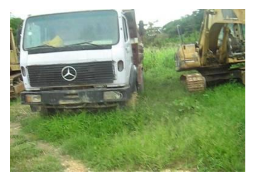
Fig. 3 Stuck equipment – resulting from refusal to pacify the river spirit