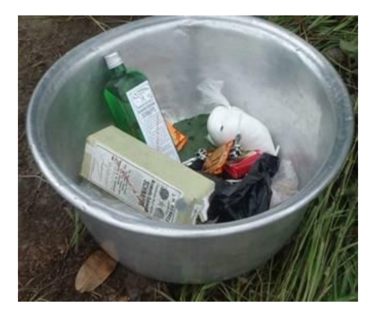
Fig. 4 Sweets for River Spirit

In the processing of very powdery gold, the particles tend to be very fine and may float on the water and report as part of the tailings or waste. Thus, the miners see gold during the processing step but may not find any gold in the final concentrate. Such observations are attributed to interference from gods.