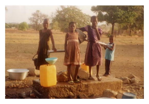
Fig. 4 Children Pumping Water from a Borehole

All the communities prefer to own and manage their boreholes despite the problems they are facing. Their reasons are that, if an external body takes over the management of the boreholes, it may sell water to them at a higher price and many people will not be able to pay for it. Some are also of the view that the water from the boreholes is free. It is therefore not justifiable to sell the water to community members. Besides, owners of land where the boreholes are located would ask for exemption from payment, claim ownership of the boreholes, ask for compensation for their land or demand for the removal of the boreholes from their farmlands if they would not benefit from the water. Selling water from the boreholes would also bring about land litigation issues, disagreement over how prices should be fixed, and the control and usage of revenue accruing from the sale. The problems that would arise from all these may derail the present management system. It was learnt that land litigation are common in communities with irrigation dams because of the economic activities around them. Unlike irrigation dams, land tenure is not a problem to the provision of boreholes in the area because the size of land used for a borehole is small and the water from them is not for sale.