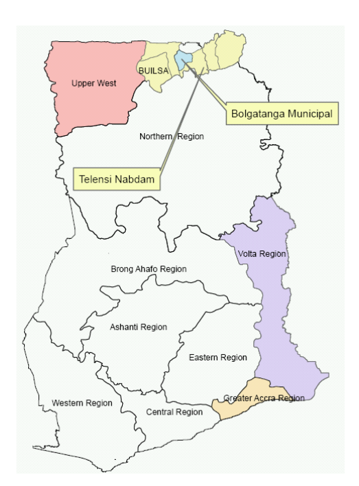
Fig. 1 Location Map of the Study Area (Anon, 2009)

The annual mean temperature for the District is about 35°C. Between November and February the area is characterised by cold, dry and dusty harmattan winds. Temperatures during this period could be as low as 14°C at night but could go up to more than 35°C during the day (Anon, 2005). The District is drained mainly by the Red and White Voltas, Kuldaga-Kulibuliga and Atamore Rivers. It experiences one short rainy season that often begins in May and ends in mid-October with heavy rains occurring between July and mid-September. This is followed by a prolonged dry season beginning from October to April. During the dry period most of the rivers, dams and dug-outs in the area dry up due to the resulting high evaporation rates. The annual rainfall figures from 1996 to 2009 vary between 855 mm and 1269 mm with a mean of 1 000 mm showing that there was enough precipitation to recharge ground water. Relative humidity from July to September is 91% and 15% from December to January respectively.